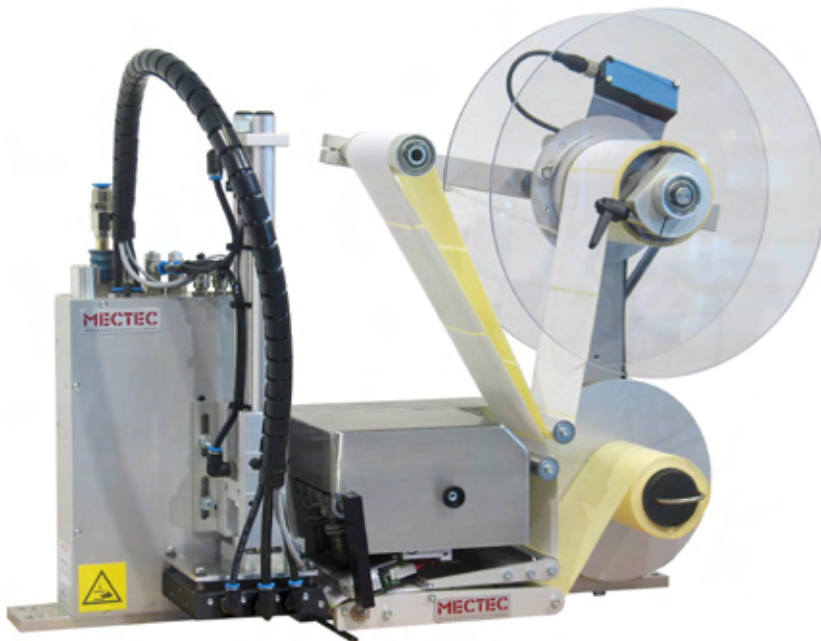
Printer and applicator in right hand version