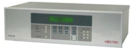
Printer Control Unit PCU III (Please note: ACC not included)