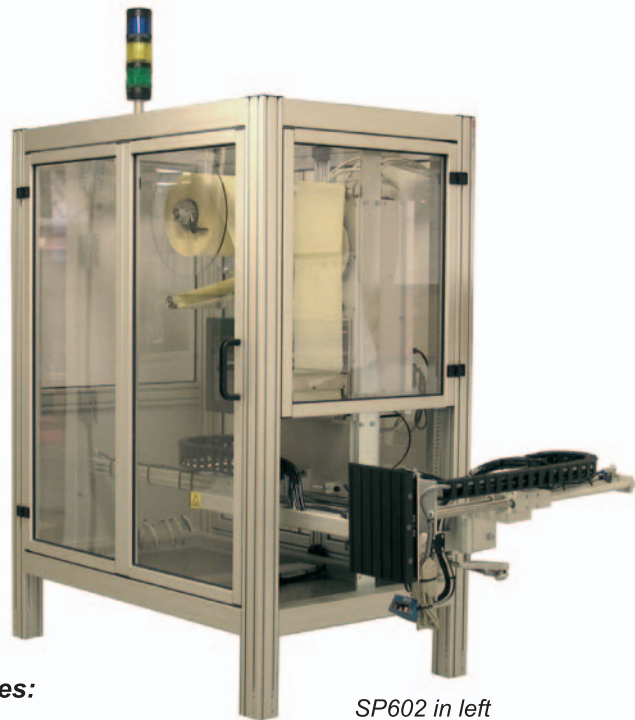
SP602 in left hand version.

With the SP602 system we connect you to the world of Zebra® based printers and software. The usage of Zebra Pax III OEM Print Engine ensures you a fast and reliable solution!